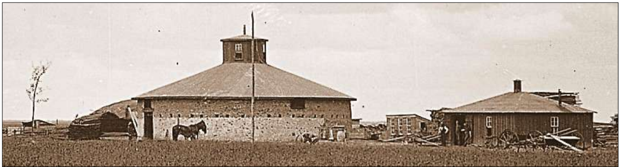
Images #6: The blacksmith shop (right) was located close to the round stone horse stable. (1884)

It is also possible that the dinner bell was manufactured on the farm by the resident blacksmith.