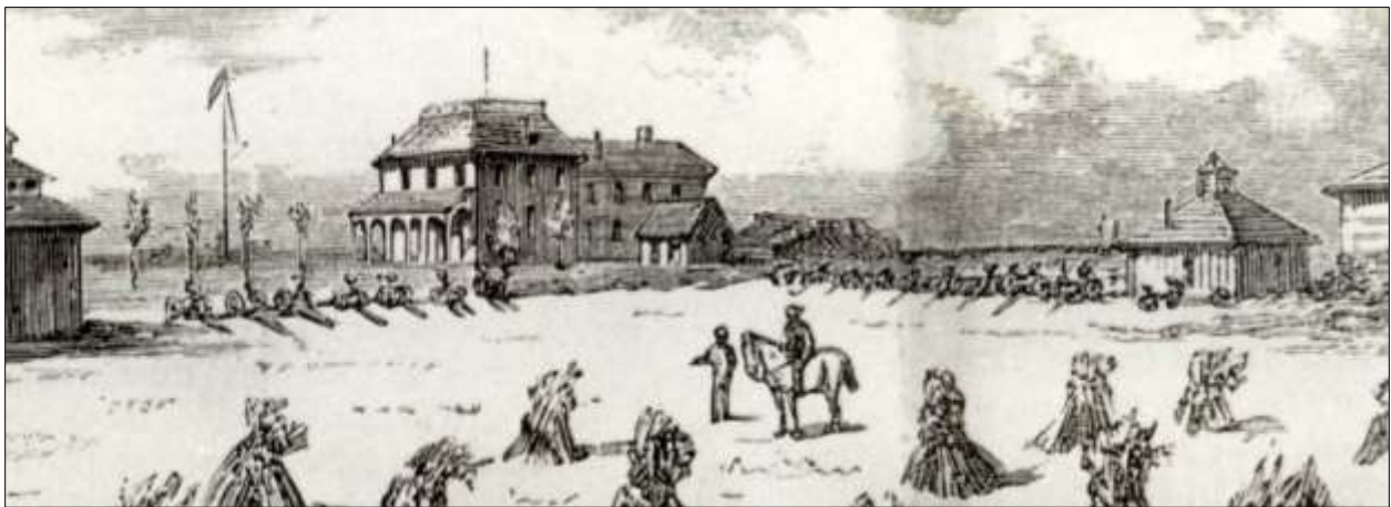
Images #5: Sketch of the Bell Farmyard on Oct. 25, 1884, by T.H. Thomas; a small portion of the round barn is visible at the far right, next to the square building.

“About 15 o’clock on Friday last fire was discovered in a double barn near the Northern Bell Farm Cottage occupied by Geo Bingham. The barn contained two horses which were burned to death, and the barn with contents will be a complete loss.”